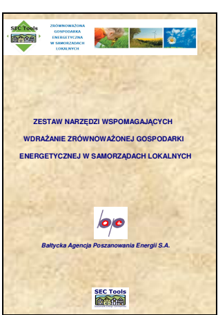
Pict.1 SEC Toolbox by BAPE